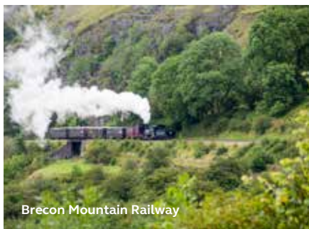
Brecon Mountain Railway