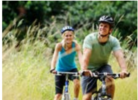
Clachtoll near Lairg

The Highlands has been recognised by the International Mountain Bike Association as one of the great biking destinations and offers an abundance of trails, forest and wilderness riding to suit all levels and abilities.