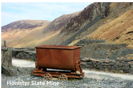
Honister Slate Mine