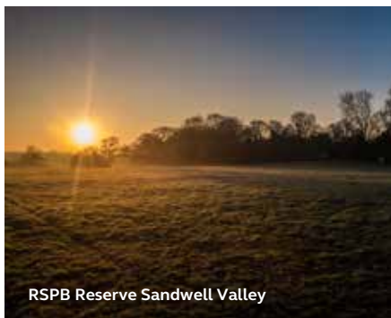
RSPB Reserve Sandwell Valley