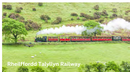
Rheilffordd Talyllyn Railway