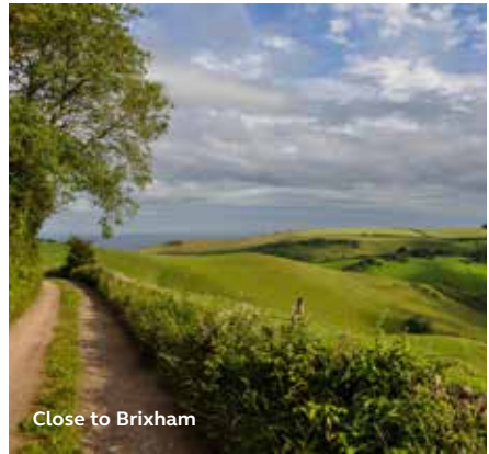
Close to Brixham

This route starts near Newton Abbot train station and heads south east along future NCN route 28 towards Torquay, then along the coastal path to Paignton and then onto Brixham breakwater.