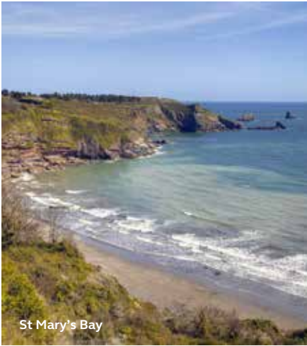
St Mary's Bay