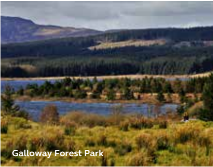
Galloway Forest Park