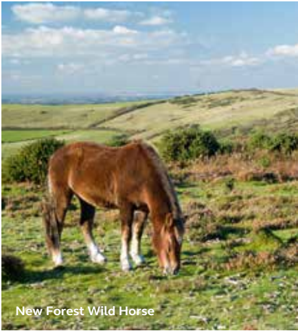
New Forest Wild Horse