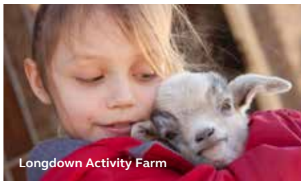
Longdown Activity Farm