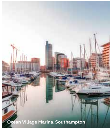
Ocean Village Marina, Southampton