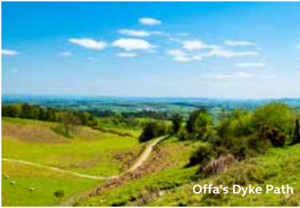
Offa's Dyke Path