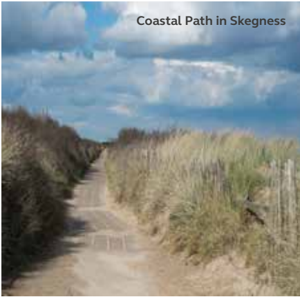
Coastal Path in Skegness