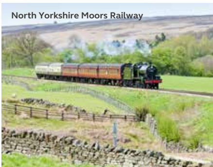
North Yorkshire Moors Railway