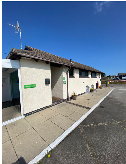
Beach Side Toilet Block