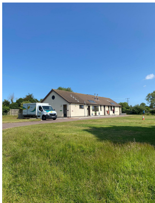
Main Toilet Block