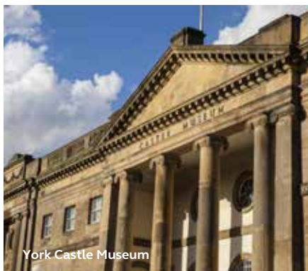
York Castle Museum